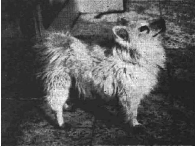
Beautiful 7 years-old white dog, Jackie lives with us as a raw vegan from the first of his life.

Now it is easily proven that meat eating is unnatural even for other animals, and we don't have real carnivores. Jackie has been accustomed to the food we eat since birth. Most of his food consists of wheat, dates, raisins, pistachios, salads and various fruits, all of these in live (raw) form, because in our house there is not even a single gram of dead food. This dog even eats onions and radish with great desire. When we take him outside the city, he grazes like a lamb in the green meadows. Compared to other dogs, this dog is extremely healthy, fresh and full of energy. If we want to accustom the cubs of lions, leopards and wolves to eat plants like this dog, after a few generations they will completely abandon their ferocity and become calm, and they can live together with other animals such as cows. But on the contrary, we can never get cows used to eating meat.